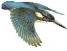
Witham First District IDB

Witham House, J1 The Point, Weaver Road, Lincoln LN6 3QN Tel: 01522 697123