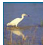
North East Lindsey