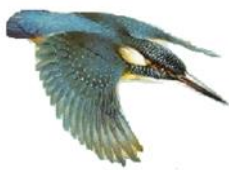
Witham First District IDB

Witham House, J1 The Point, Weaver Road, Lincoln LN6 3QN Tel: 01522 697123