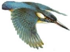
Witham First District IDB

Four independent statutory Land Drainage and Flood Control Authorities working in partnership. Witham House, Meadow Lane, North Hykeham, Lincoln LN6 9TP. Tel: 01522 697123