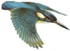
Witham First District IDB

Witham House, Meadow Lane, North Hykeham Lincoln LN6 9GJ Tel: 01522 697123