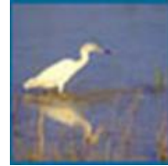
North East Lindsey