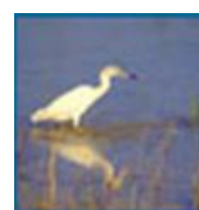
North East Lindsey