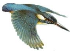
Witham First District IDB

Four independent statutory Land Drainage and Flood Risk Management Authorities working in partnership.