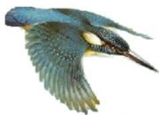
Witham First District IDB

Four independent statutory Land Drainage and Flood Risk Management Authorities working in partnership.